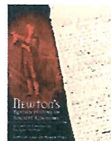
Newton's Revised History of Ancient