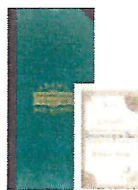
Adams' Chart of History